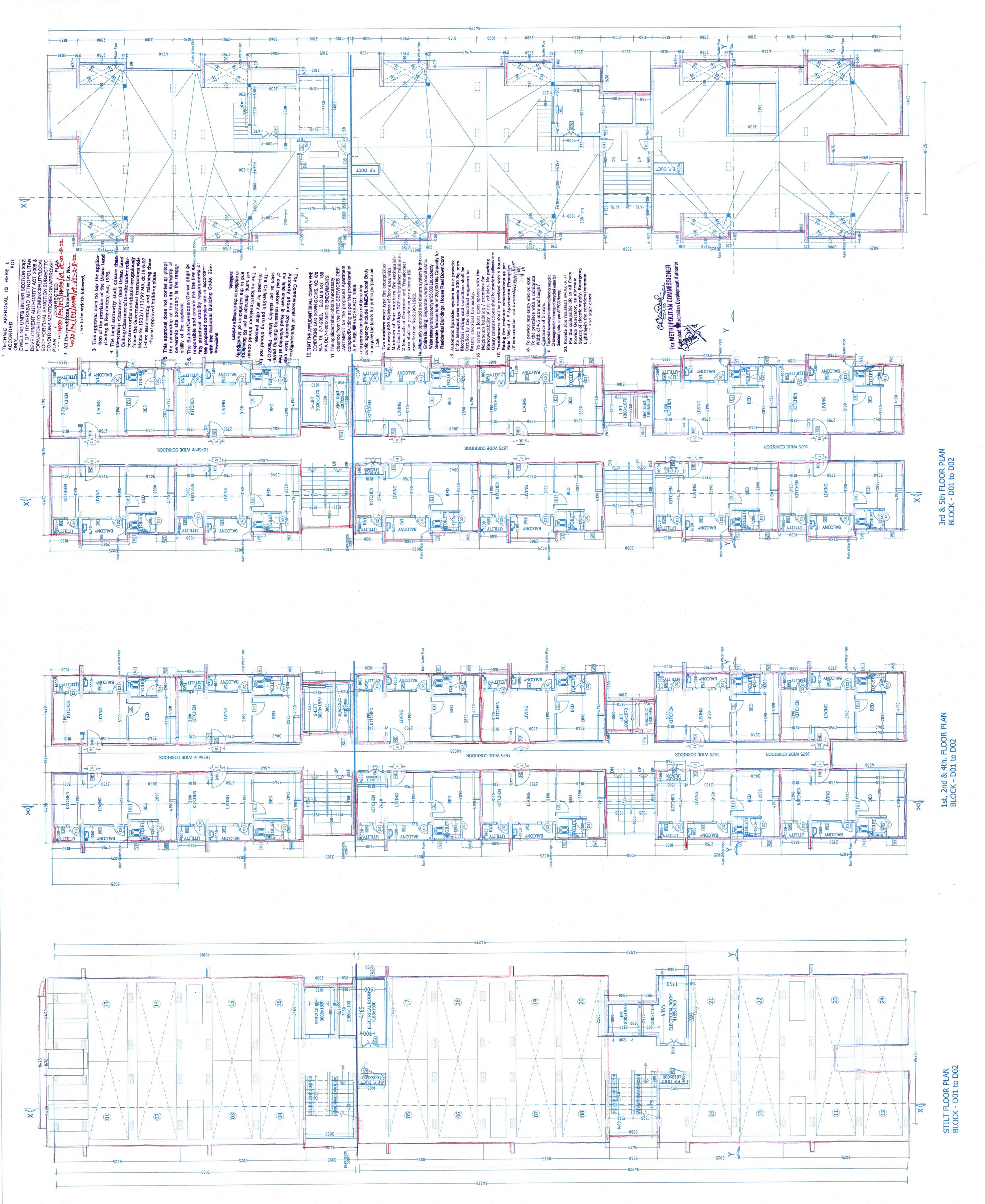
1st, 2nd & 4th FLOOR PLAN BLOCK - D01 to D02

SENIOR ARCHITECT [Signature] [Redacted] COA Regd. No: CA/2011/5423